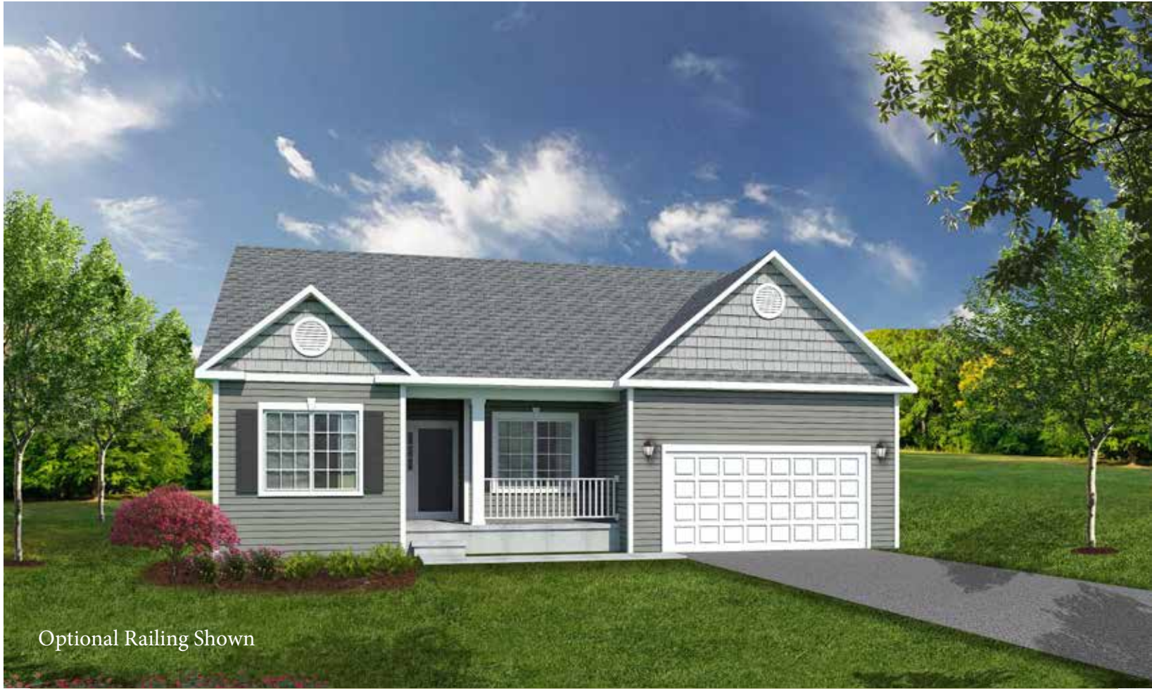
Optional Railing Shown