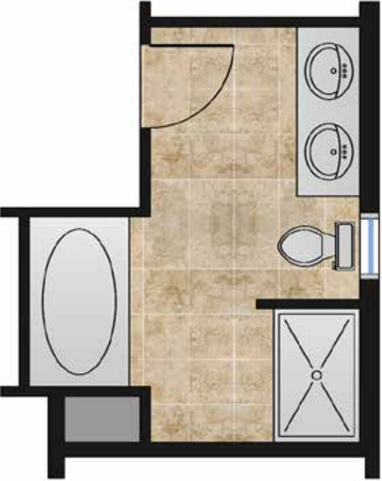
LUXURY BATH OPTION

Optional Features shown. The plans and elevations on these pages are for illustrative purposes only. Floor plans, features, and kitchen designs may vary according to alternative styles selected or modifications to the plan and are subject to change without notice. All dimensions are to be considered approximate. Artist renderings may include options available at additional cost.